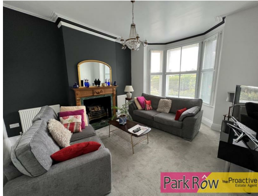
DINING ROOM 4.60 x 4.20 (15'1" x 13'9")