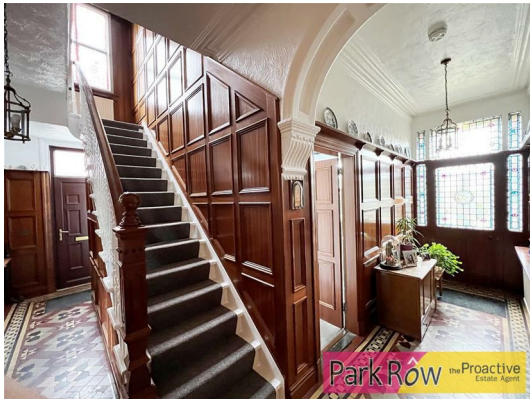
COMMUNAL LOUNGE 4.20 x 4.60 (13'9" x 15'1")