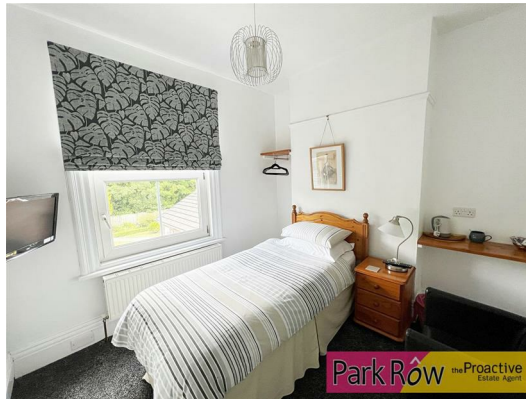
ENSUITE FIVE 0.96 x 2.68 (3'1" x 8'9")