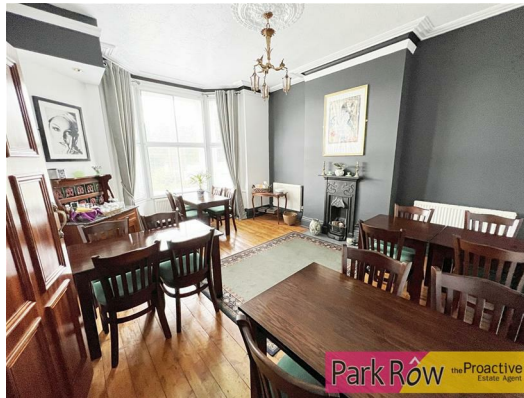
OWNERS DINING KITCHEN 2.43 x 3.81 (7'11" x 12'5")