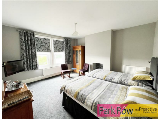
ENSUITE FOUR 1.45 x 2.68 (4'9" x 8'9")