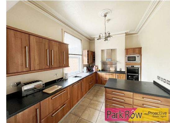
STORE ROOM 2.07 x 2.83 (6'9" x 9'3")