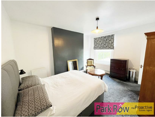
ENSUITE TWO 4.15 x 2.68 (13'7" x 8'9")