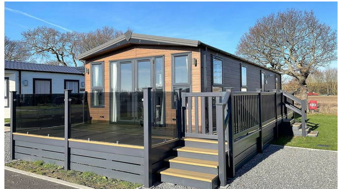
With composite decked area and newel posts with smoked glass balustrade to the side and leading to the front of the property which offers spacious area for socialising. Outside lighting and steps leading to designating parking area.