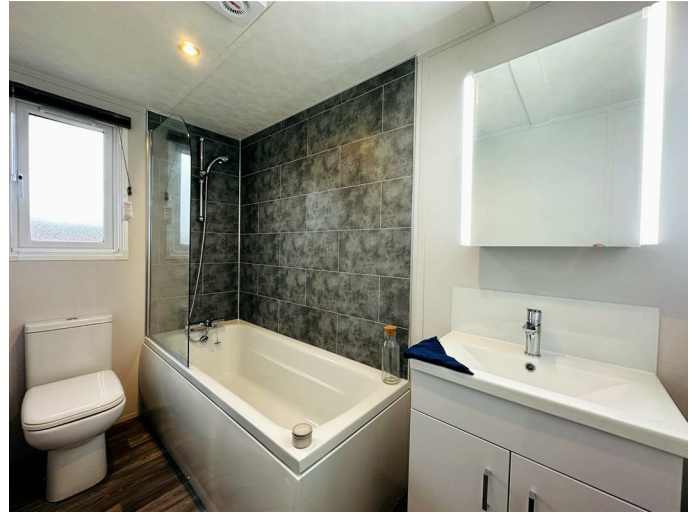
White panel bath with chrome mixer tap over and shower attachment. Chrome trimmed shower screen. White low flush w.c with chrome fittings and wash hand basin with chrome mixer tap over set into high gloss vanity unit. Mirrored wall mounted cupboard with LED lighting. UPVC double glazed frosted window to the side elevation. Chrome heated towel rail, electric extractor fan and wood effect vinyl flooring.