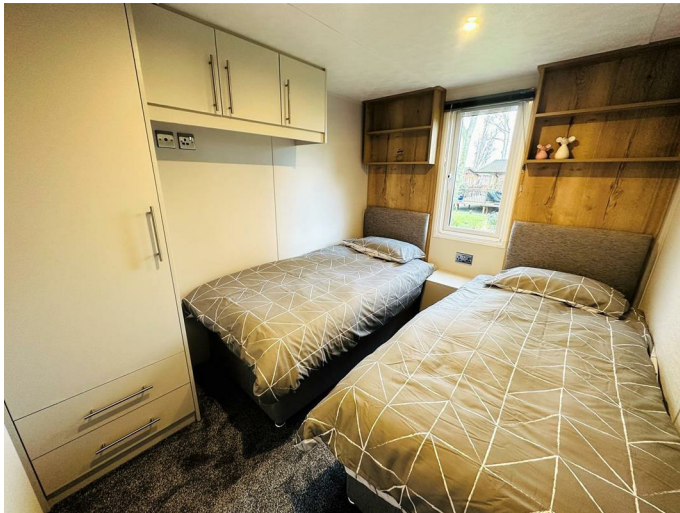
Range of grey fronted fitted wardrobes and shelving space, television point and central heating radiator. UPVC double glazed window to the side elevation.