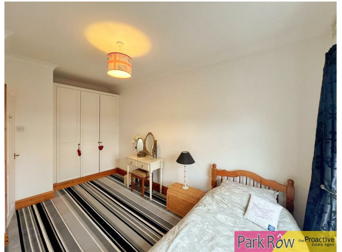
Range of fitted wardrobes. UPVC double glazed window to the rear elevation and central heating radiator.