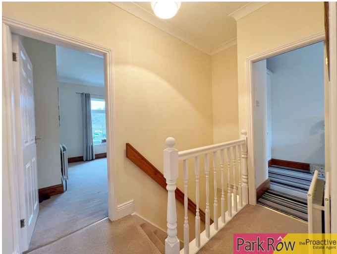
Bedroom One 15'05 x 12'00 (4.70m x 3.66m)