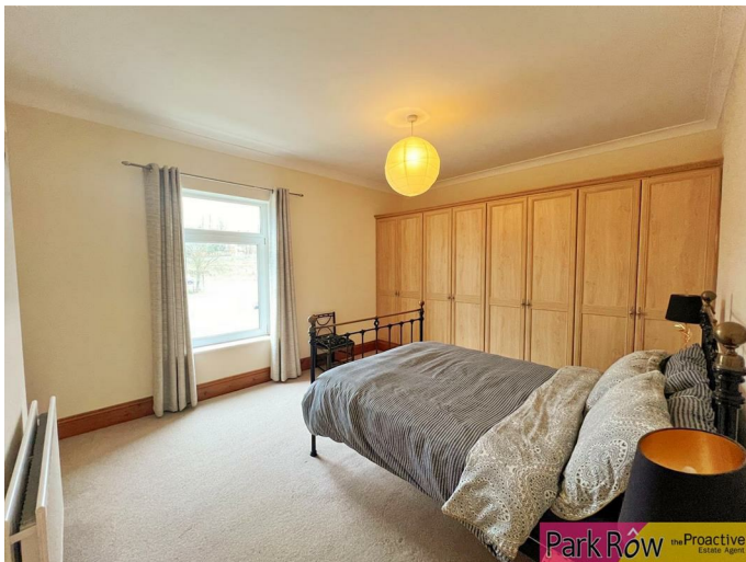
Range of timber fronted fitted wardrobe. UPVC double glazed window to front elevation and central heating radiator.